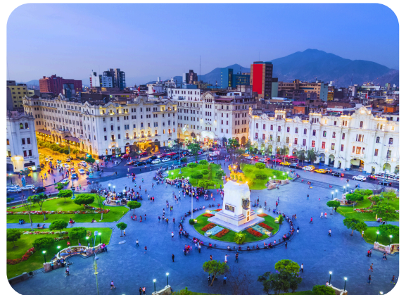
Lima Main Square

The following morning, embark on a full-day tour of the Sacred Valley – a history-rich region on the Andean highlands that was once the beating heart of the Incan Empire, alongside the nearby town of Cusco and ancient citadel of Machu Picchu. The excursion begins with a visit to the quaint town of Pisac, renowned for its iconic "empanada" ovens. Sample a selection of these delicious baked pastries, and then learn about the Peruvian artistry through local ceramics, weavings, and jewellery stores lining the town's small shopping street! Afterwards, head to Ollantaytambo, where you'll be welcomed by ancient ruins, breath-taking views, and an authentic glimpse into the traditional way of life in the Sacred Valley! (B)