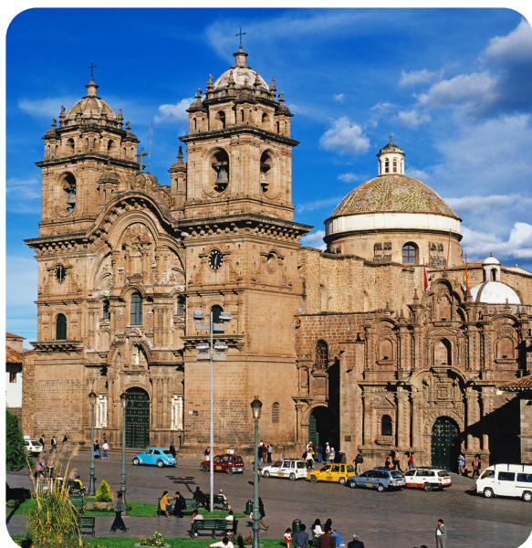
Cathedral of Cusco