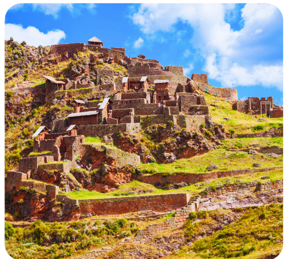
Pisac in Sacred Valley