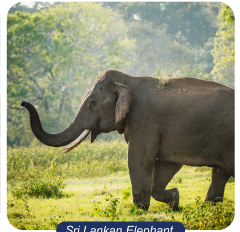
Sri Lankan Elephant