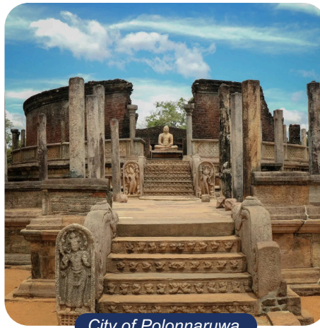
City of Polonnaruwa