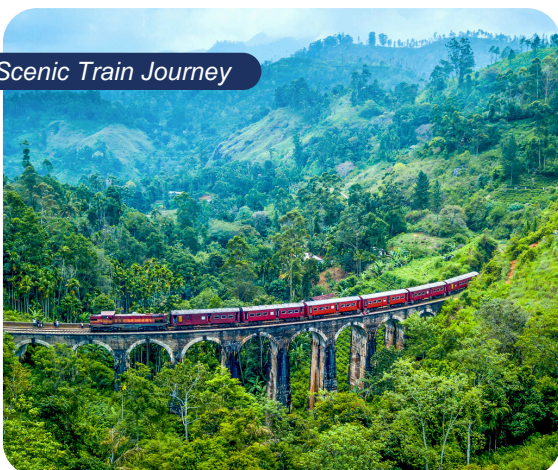
Scenic Train Journey

From the quaint village of Nanuoya, you'll embark on a scenic train journey to Kandy, winding past lush green hills and charming villages along the way! With a 2-night deluxe hotel stay at Golden Crown, you'll have ample time to visit the famed Royal Botanical Gardens and experience the traditional Kandyan performance, both offering a glimpse into the authentic Sri Lankan nature and culture! (B,D)